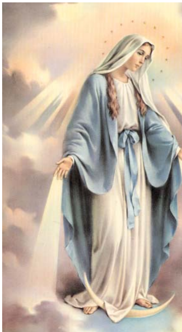
Mary Mediatrix of All Graces.

In this distressing and dramatic time of war against the Catholic Church and Christian Civilization, let our Holy Rosary be the sword of dazzling fire which will stop the stream of the “Red Sea” and will hasten the victory of Christ the King and of His Church . Amen!