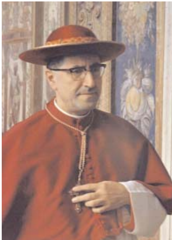
Card. Giuseppe Siri.

The message was clear: with this ominous Conclave that had thrust open the doors to the Masonic invasion into the Church, why doesn't Mel Gibson make this known to the world, with one of his films, thereby completing the work he had left half-done?